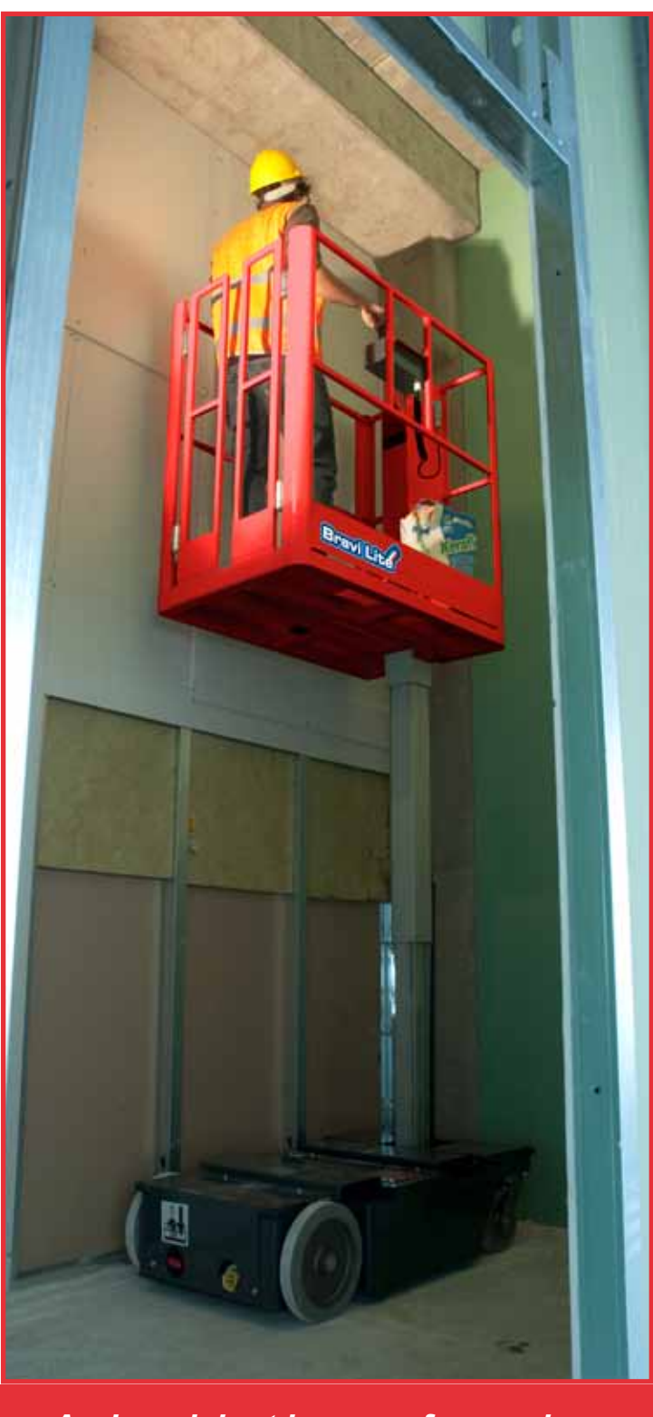
And work just became fun again...

This all-new platform from Bravi uses proven technology and yet is MORE COMPACT and EVEN LIGHTER than most currently available platforms; it also boasts a LOWER COST OF OWNERSHIP.