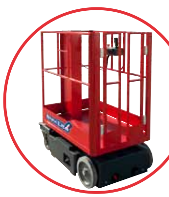
Compact & Powerful