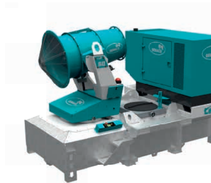
TERA fitted with CC Watertank