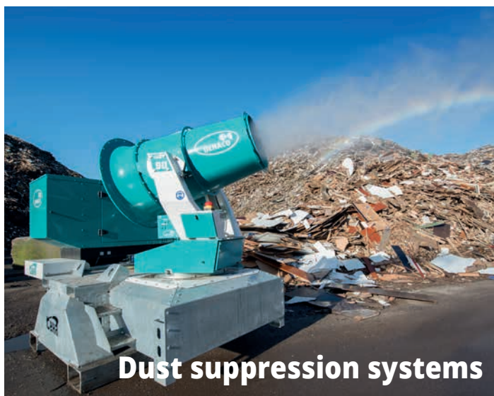
Dust suppression systems